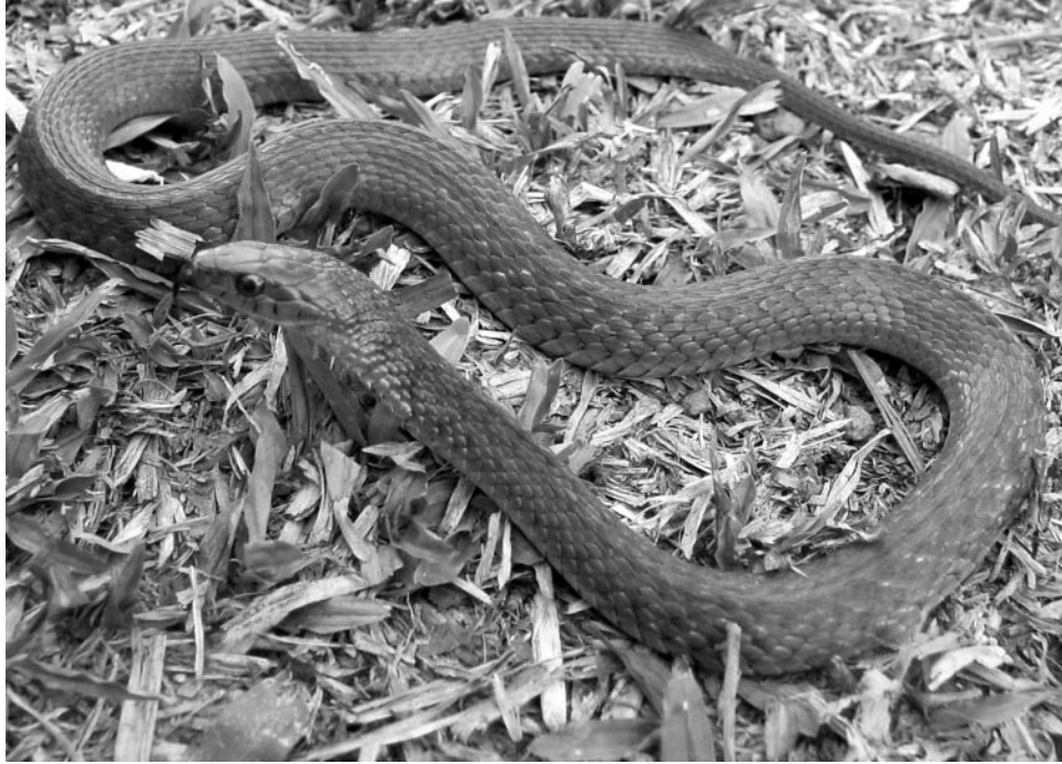
PLATE 1. Adult keelback snake ( Tropidonophis mairii ).